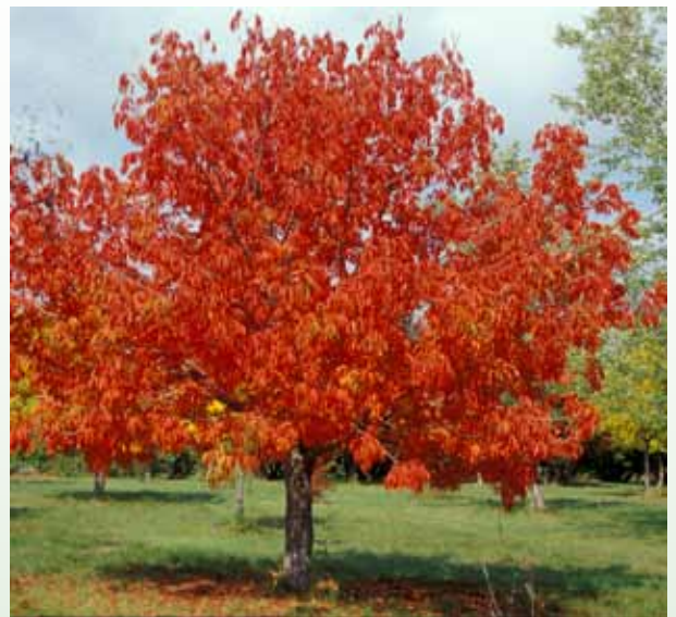
A3. Brilliant orange-red autumn coloration.