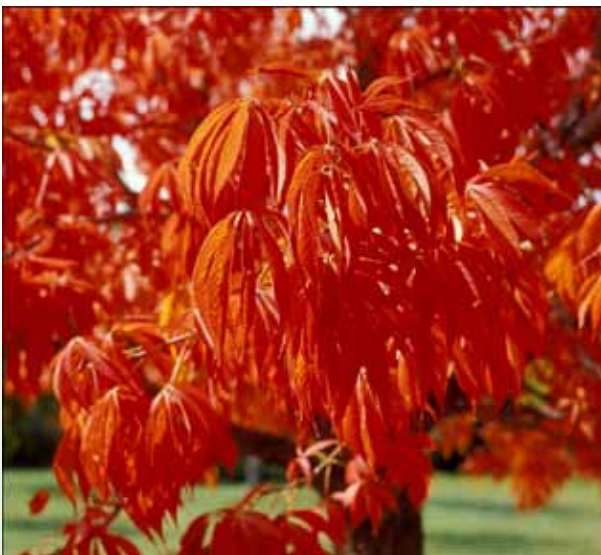
A2. Close-up of fall color extravaganza.