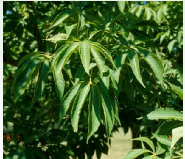
A1. Quality green foliage, leaf scorch resistant.

Prairie Torch® Buckeye is a very winterhardy hybrid buckeye selected in northwestern Minnesota. It was introduced by NDSU in collaboration with Bergeson Nursery, Fertile, MN. In NDSU trials, it grew faster than most buckeye accessions for the first 10 – 15 years, producing a dense, globose form. With age it broadens, becoming more mushroom-shaped. The ultimate size of trees is small to medium (20 – 25 feet), which fits well in residential landscape sites. The foliage is of high quality, fairly coarse-textured, and typically composed of seven leaflets, which incline downward in an umbrella-like fashion. These characteristics lend a tropical touch to the tree's appearance. Autumn coloration in sandy or loamy textured soils, is brilliant orange-red. This cultivar and also those below, are far superior in foliage qualities to most seed propagated Ohio Buckeye – Aesculus glabra . Limited but increasing availability in nursery trade. Hardy to USDA hardiness zone 3. Small shade and landscape specimen tree. It is propagated by grafting, also possible by budding and softwood cuttings. Two other quality hybrid buckeyes include Autumn Splendor Buckeye from the University of MN and Homestead Buckeye from South Dakota State University. These three superior cultivars do not defoliate prematurely due to physiological leafscorch like the Ohio Buckeye.