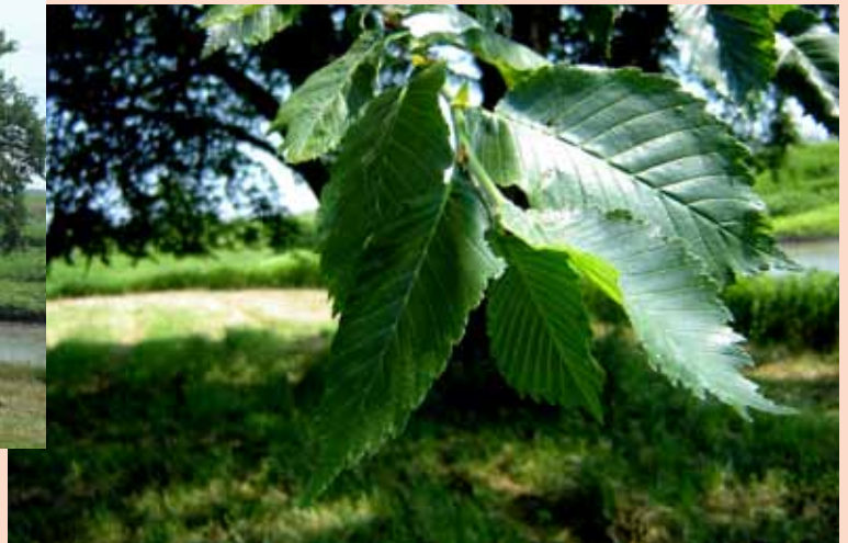
A2. Close-up of quality, luxuriant green foliage