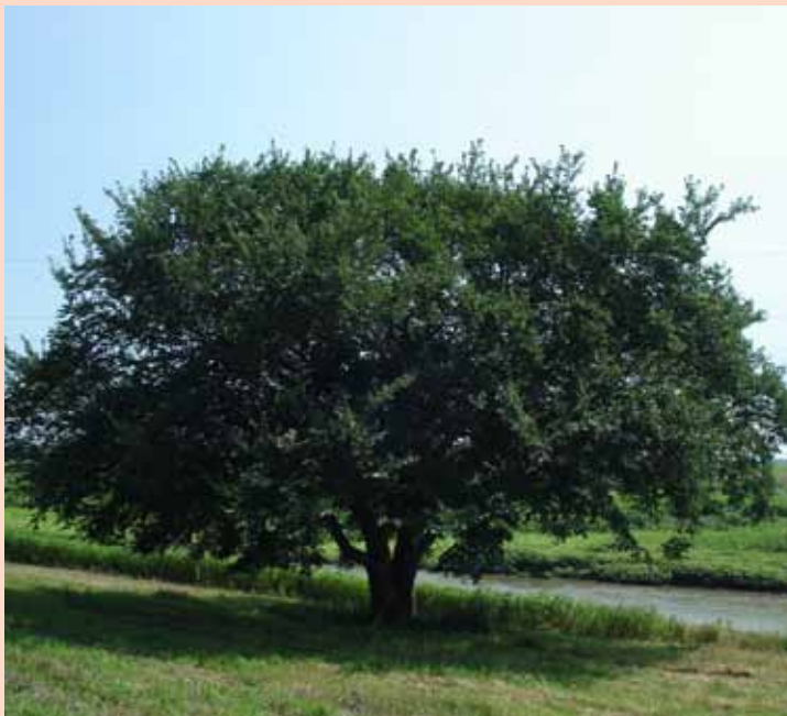
A1. Classic umbrella form

This North Dakota State University selection is a lone survivor among American elm trees that died from Dutch elm disease along the Wild Rice River southwest of Fargo, ND. When inoculated with the Dutch elm disease fungus, this tree displayed high resistance. The original tree is still healthy and has continued to resist DED infection 15 years after inoculation research of clonal propagules was conducted. This selection produces dark-green foliage and develops the classic umbrella form which typifies American elm. Clonally-propagated trees planted under clean cultivation in NDSU trials averaged over three feet of growth annually for 10 years. The American Elm is North Dakota's State Tree and this selection was released and named for its apparent Dutch elm disease resistance in honor of the 200th anniversary of the Lewis and Clark Expedition in 2004. USDA hardiness zone 2b-3. Shelter, shade and boulevard tree. Available in nursery trade. Propagated by grafting, chip budding or cuttings.